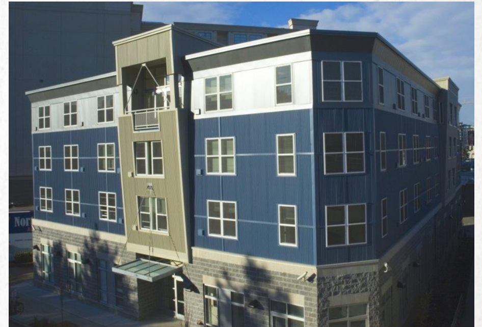
The Journal of American Medical Association Study - 2009