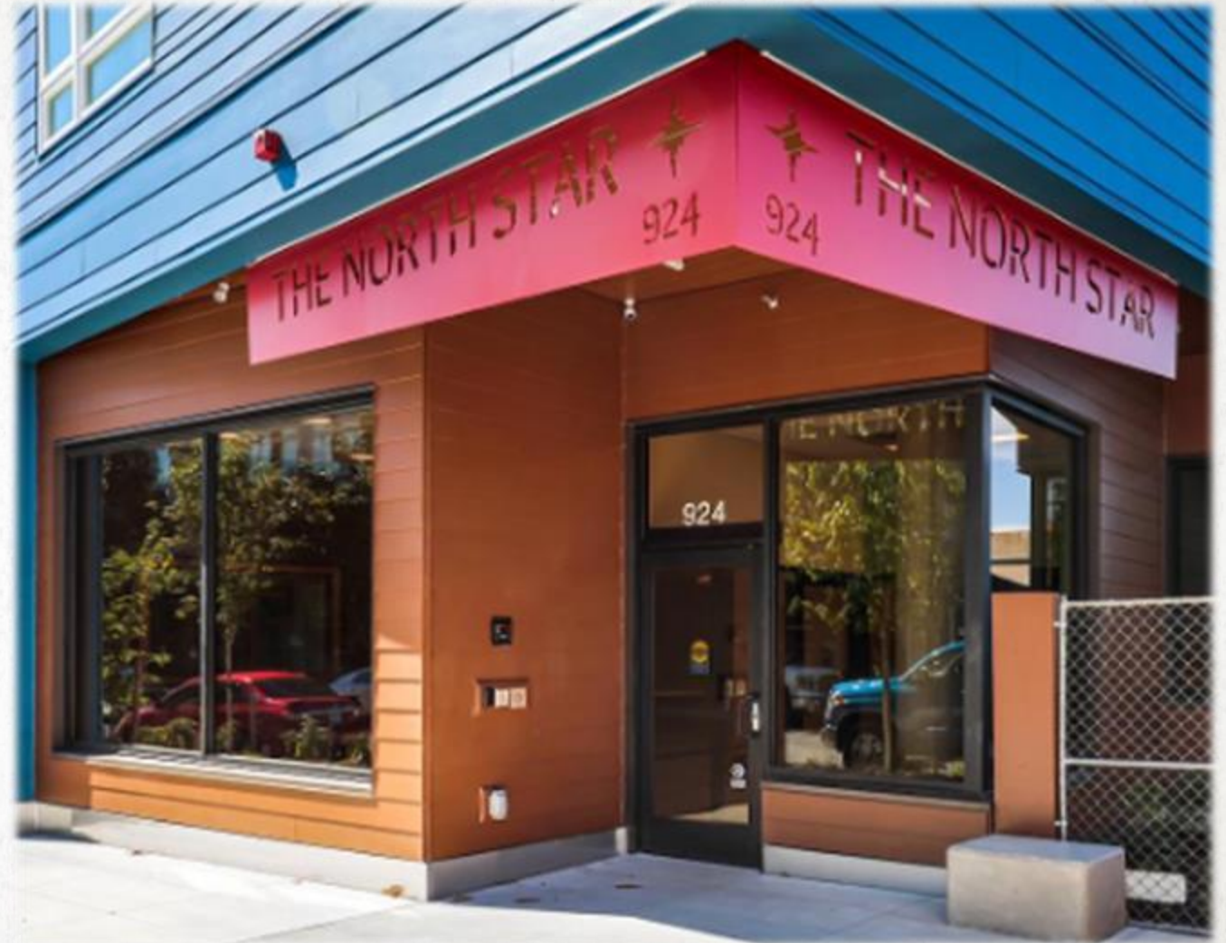
The North Star – DESC's newest permanent supportive housing location which opened in July of 2022

Without the stability of a home, other progress can't be made to achieve highest potential of well-being.